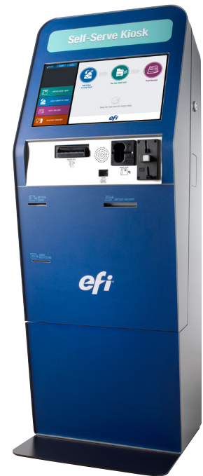
G5 Card Vending Kiosk